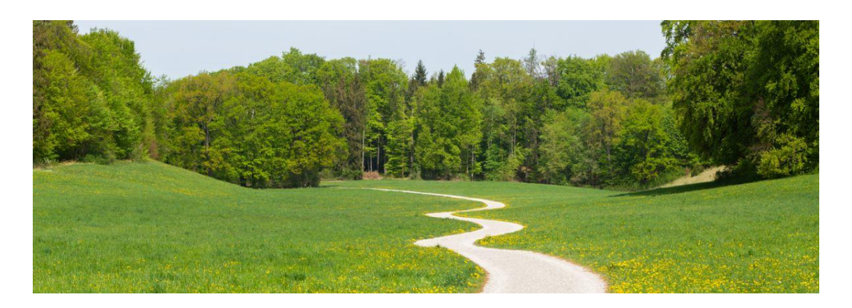
Are you a CIH® who also does Environmental work?

If you are interested in filling out an application, click here.